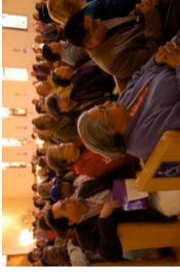
“Weaving God’s Beautiful Pattern” Event